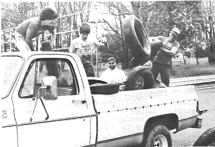
Tires fly as another truckload reaches the placement sight.