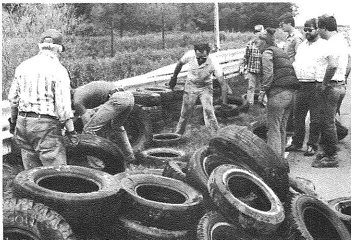
Sorting and stacking.