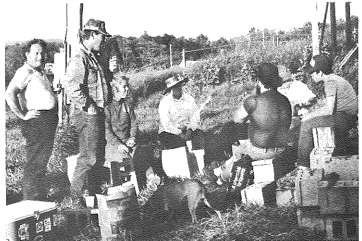
Relaxation after a day's work. photos of work crew by Ade Ketchum