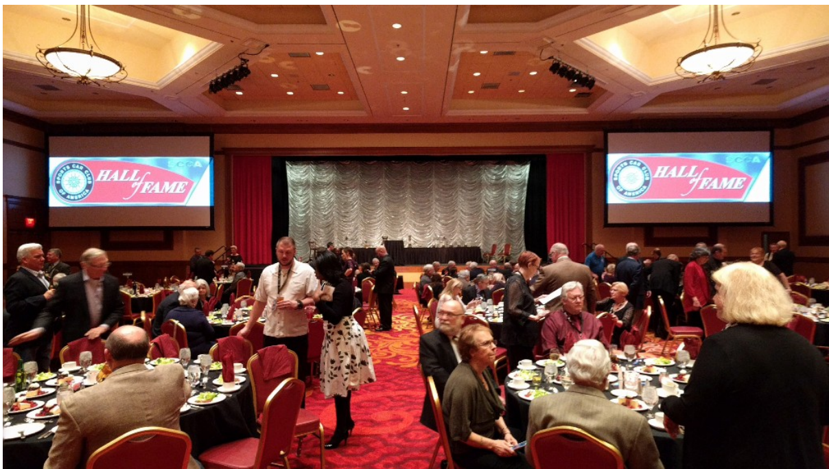
Pretty nice setup for the Hall of Fame banquet!