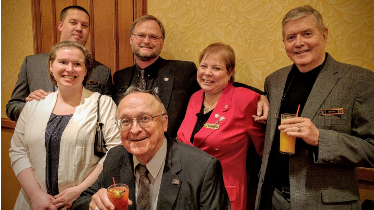
Your Glen Region representation at the 2016 National Convention - minus the Gersteins, who were somewhere not too far away.